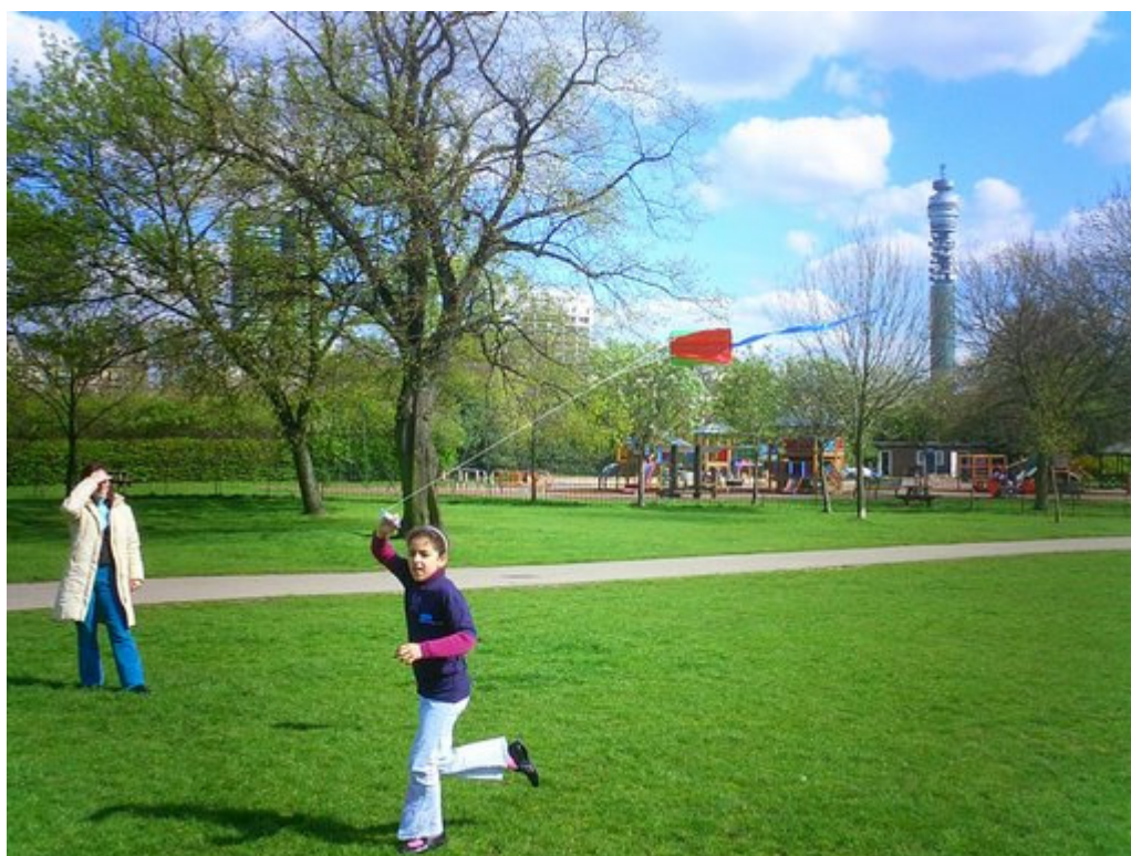
Junior school – playing with kites in Regent's Park.