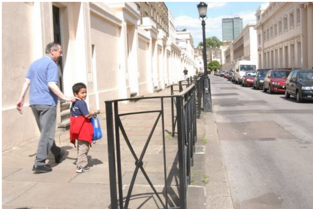
Junior School – outside view from street side