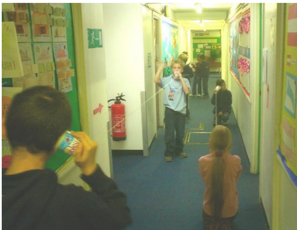
Junior school – science, learning about sound waves, and learning English!