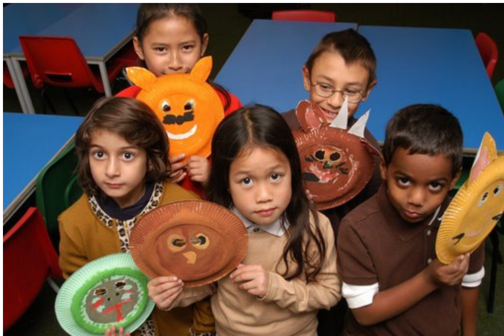
Junior school – making masks, while learning English.